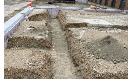
Above: Sub-slab utilities in Science Towers.