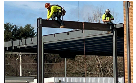
Above: Steel erection at Kitchen and new Corridor.