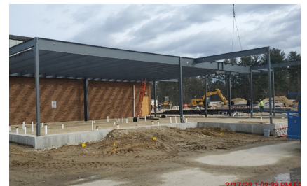
Above: Structural Steel at Kitchen addition.