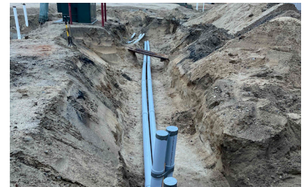
Above: Electrical conduits to new Electrical Room.